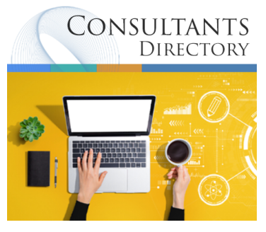
Check out IP's directory of philanthropy and fundraising consultants. Browse the listings for your next project. Apply to join the